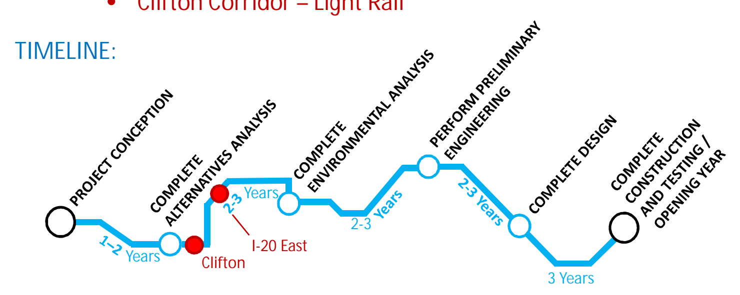
Total Timeframe: 10–14 years if funding is identified